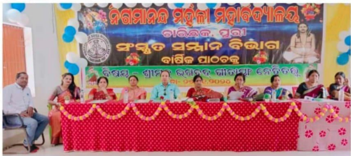
Grand Seminar 2024-2025