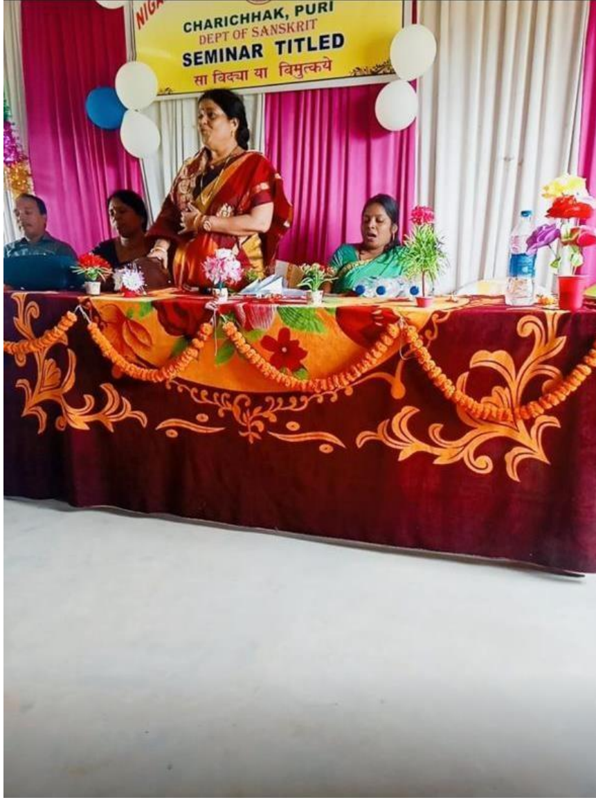
Grand Seminar 2024