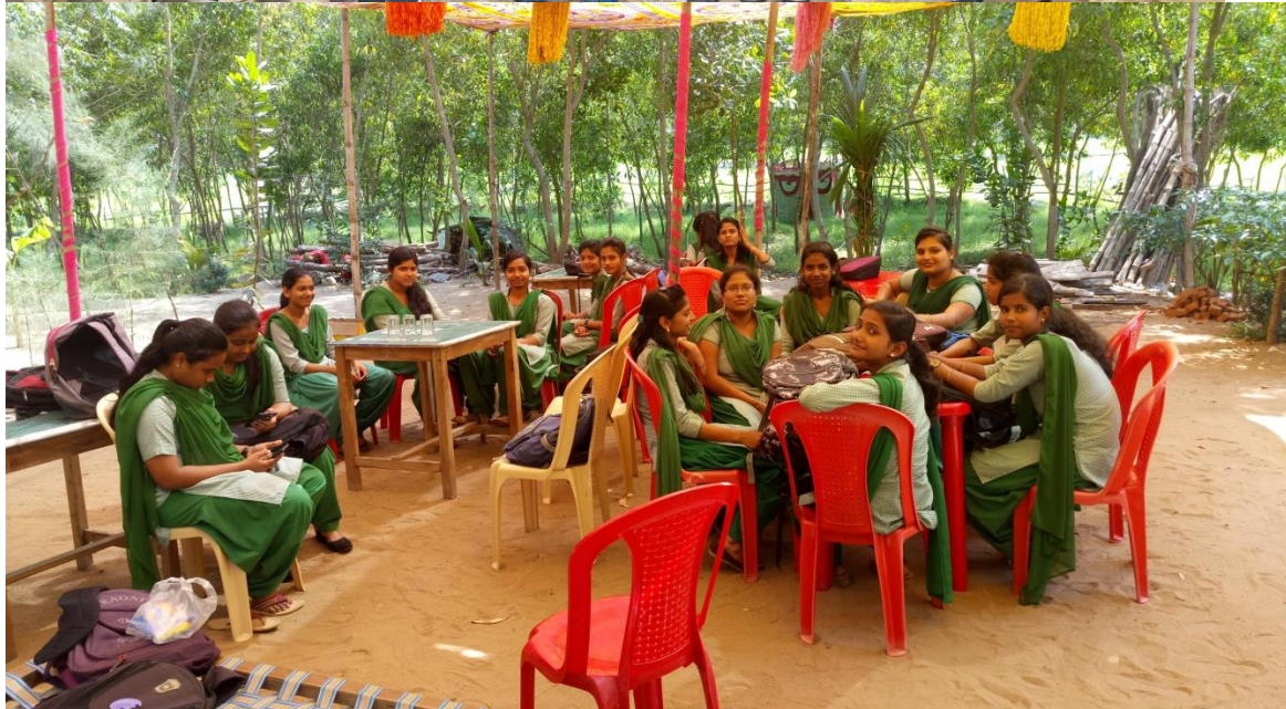
Study Tour Konark Balukhanda-2019